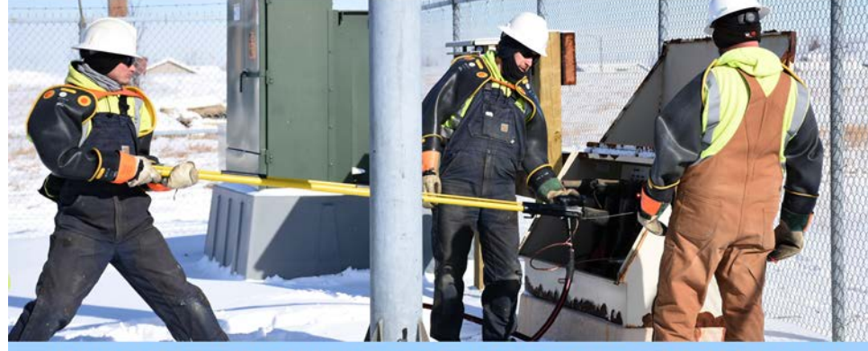
NATIONAL LINEMAN APPRECIATION DAY #THANKALINEMAN

Electric cooperatives across the state and nation are celebrating National Lineman Appreciation Day on April 9. Mor-Gran-Sou is highlighting our general foreman, area foreman, leadmen, journeyman lineman, senior engineering tech and engineering tech who maintain 3,844 miles of power lines in our service area.