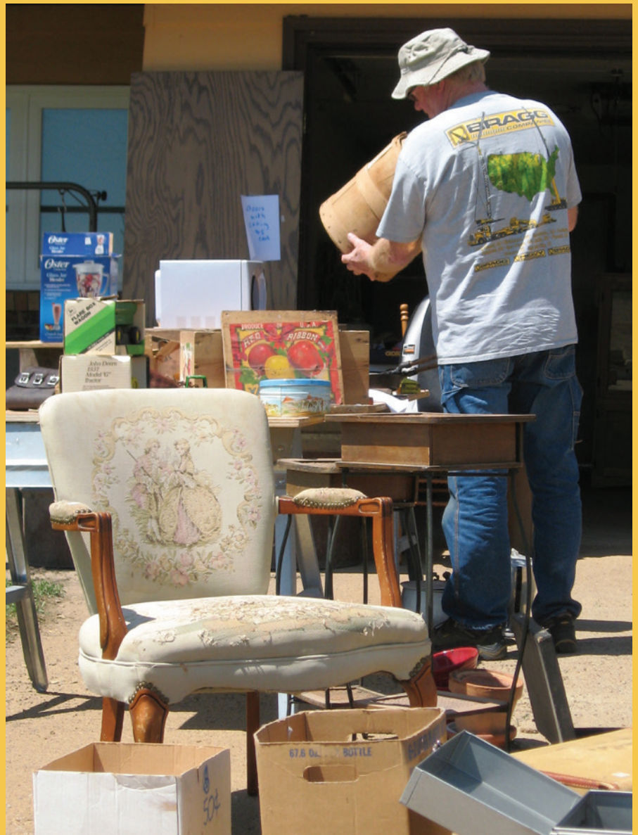
Hundreds of North Dakotans have discovered treasures during the Highway 21 Treasure Hunt, scheduled for June 21-22.