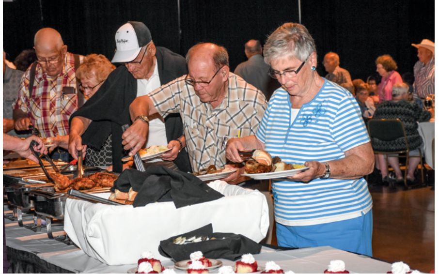
As always, Prairie Knights Casino and Resort provided a hot and delicious meal. Prairie Knights is one of Mor-Gran-Sou's largest member-owners, and the annual meeting is an opportunity for us to show our appreciation and the spirit of cooperation.

The board of directors and staff of Mor-Gran-Sou wish to thank the members for participating in the 70th annual meeting of the membership, and look forward to meeting its members' electrical needs in the future. ■