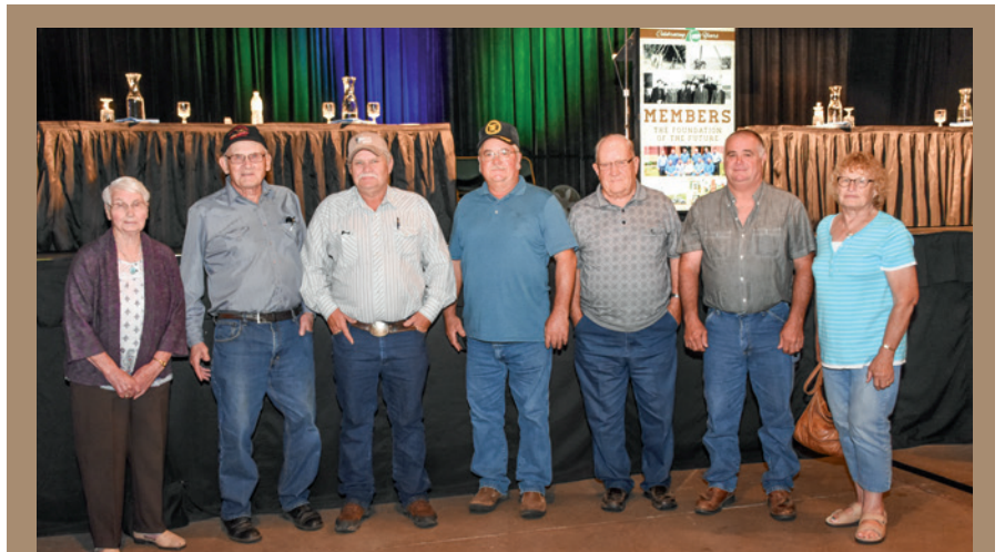
Some of the lucky winners of the $25 bill credit.