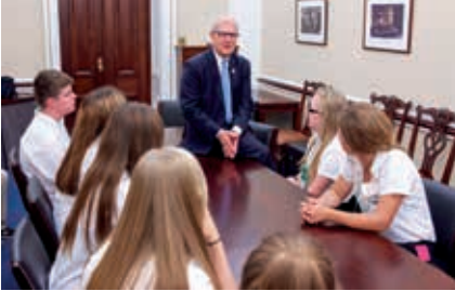
While on the trip, North Dakota's Youth Tour delegates met Congressman Kevin Cramer .