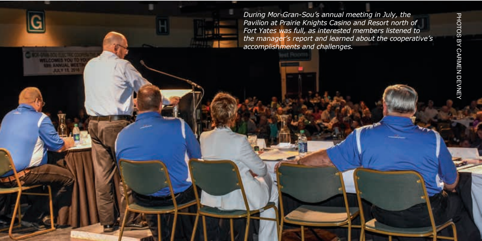
During Mor-Gran-Sou's annual meeting in July, the Pavilion at Prairie Knights Casino and Resort north of Fort Yates was full, as interested members listened to the manager's report and learned about the cooperative's accomplishments and challenges.