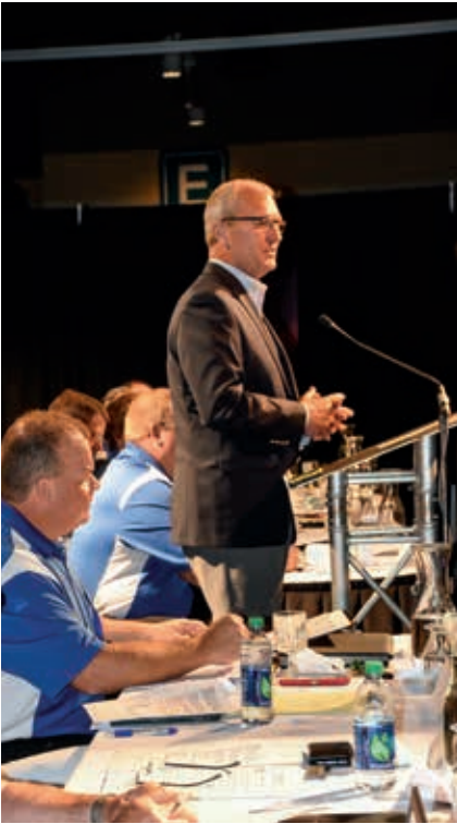
N.D. Congressman Kevin Cramer