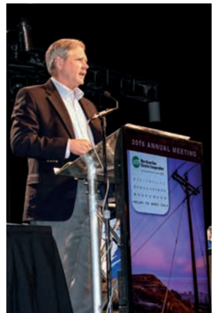
N.D. Senator John Hoeven

The board of directors and staff of Mor-Gran-Sou wish to thank the members for participating in the 69th annual meeting of the membership, and look forward to meeting its members' electrical needs in the future. ■