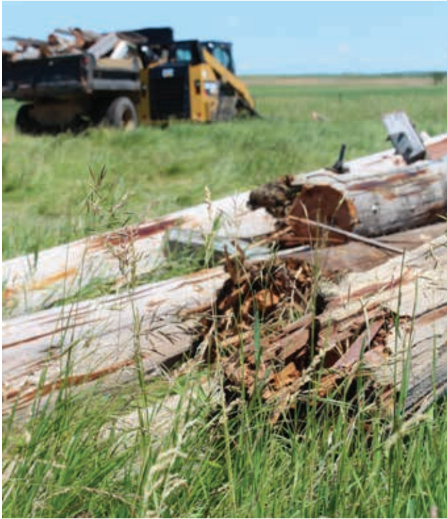
The June 21 wind and rain storm snapped 16 power poles north and east of New Salem.